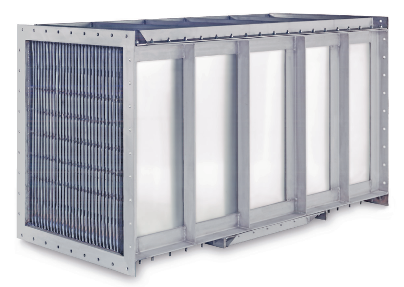
"SP" model heat exchanger featuring access covers

High heat transfer effectiveness is achieved by corrugating the heat transfer plates to achieve our exclusive sinusoidal wave pattern. The corrugated surfaces create air flow turbulence as the air passes through the unit. Heat transfer is further enhanced by using a counterflow design.